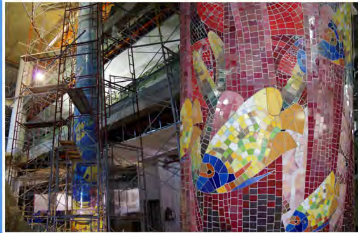
Sneak peek of the mosaic column.