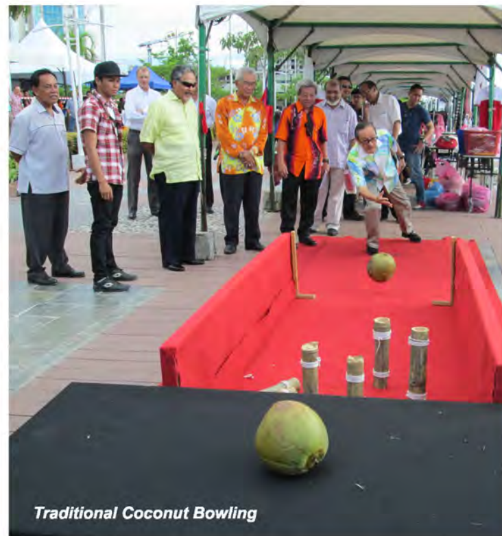
Traditional Coconut Bowling