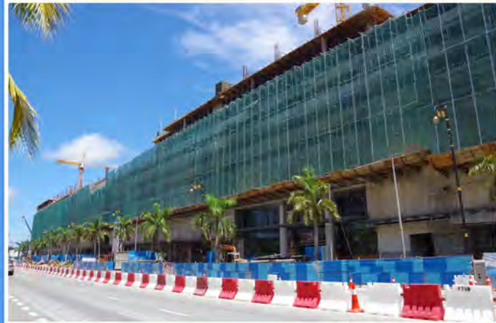
View of the exterior of The Oceanus Waterfront Mall.