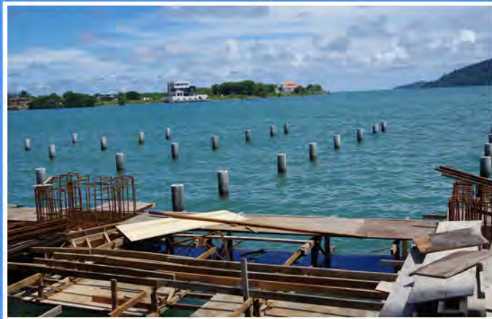
Skeleton structure of Oceanus Waterfront Mall Boardwalk.